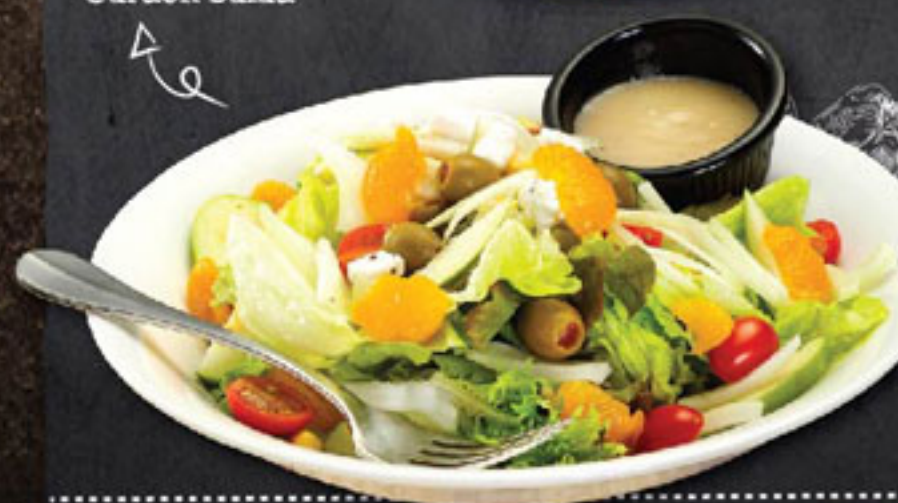
Fruity Garden Salad