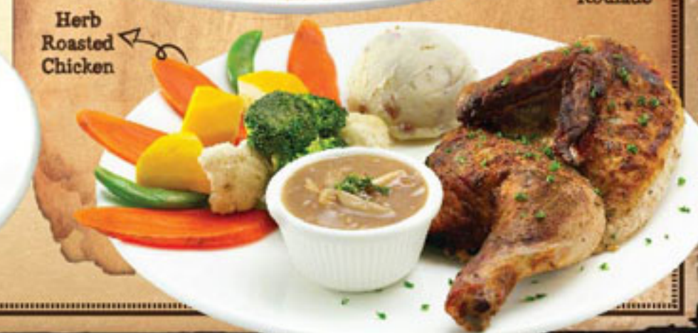
Herb Roasted Chicken