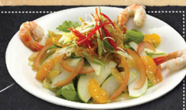
Sesame Shrimp Salad