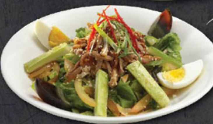
Smokin' Duck Salad