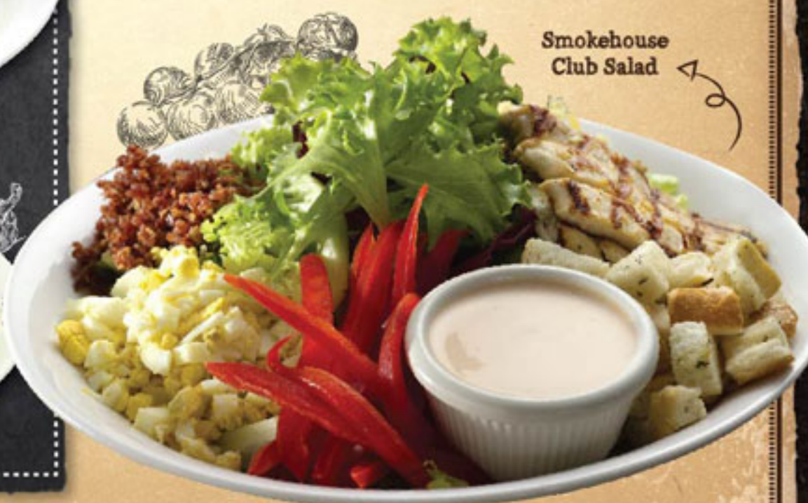
Smokehouse Club Salad

A refreshing salad of fresh greens, apples, mandarin oranges, cherry tomatoes, corn kernels, green olives & feta cheese drizzled with Morgan's house dressing.