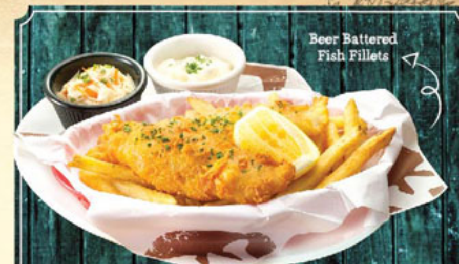
Beer Battered Fish Fillets