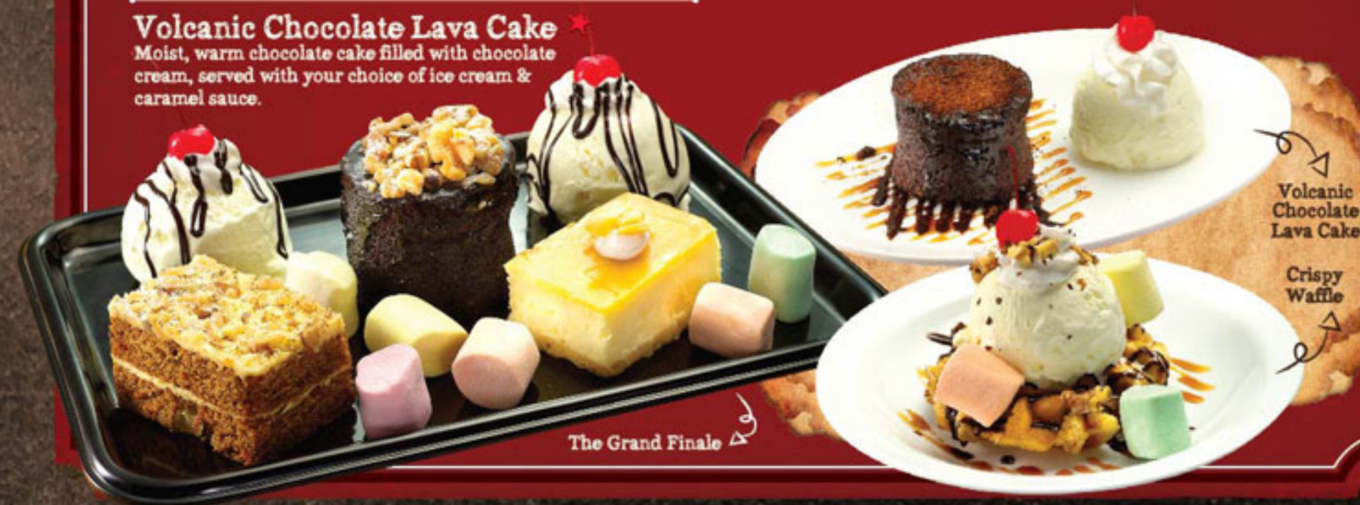
Volcanic Chocolate Lava Cake

The perfect end to a perfect meal! Select any 3 of your favorite desserts & combine them into one sinfully delicious dessert platter. Yes, diet can wait.