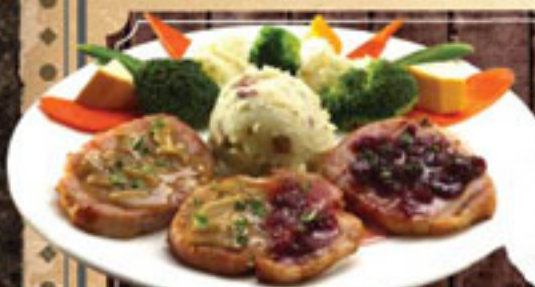
Pork Ham Chops

Tender & juicy grass fed chilled Australian sirloin char-grilled to order. Served with a capsule of Merlot garlic butter, loaded baked potato & garden veggies.