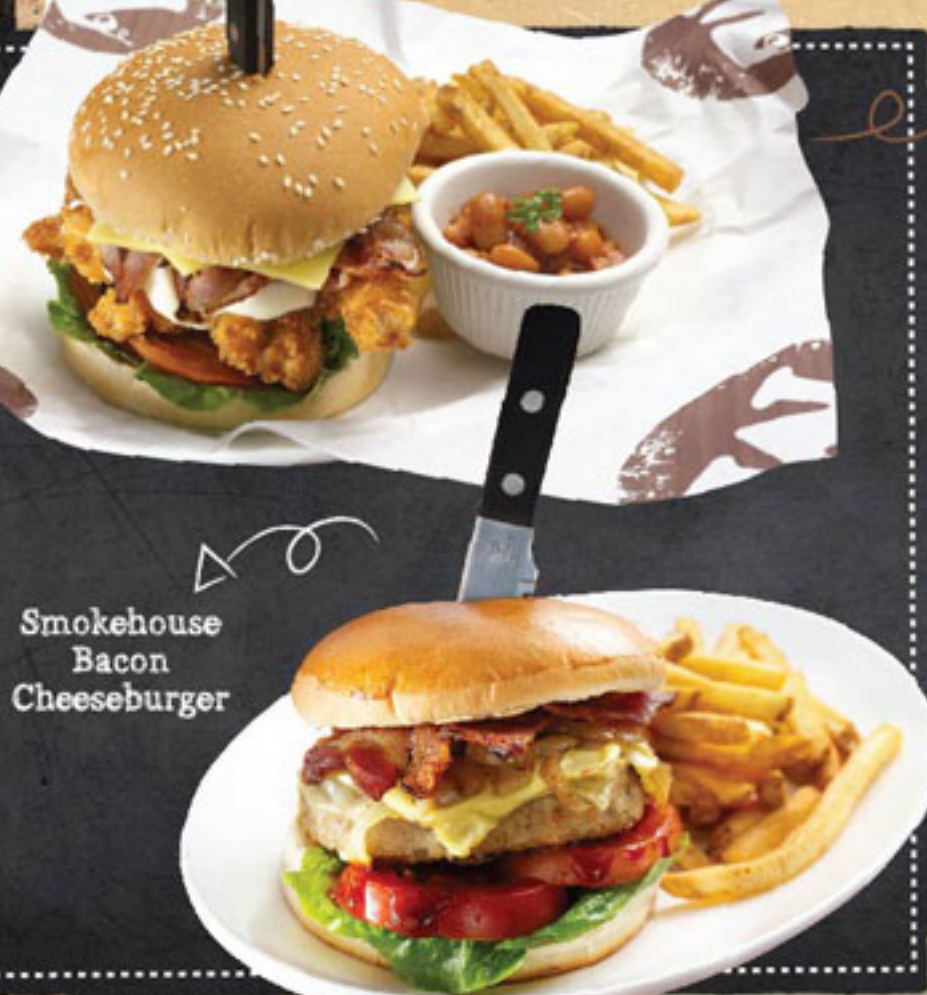
Smokehouse Bacon Cheeseburger