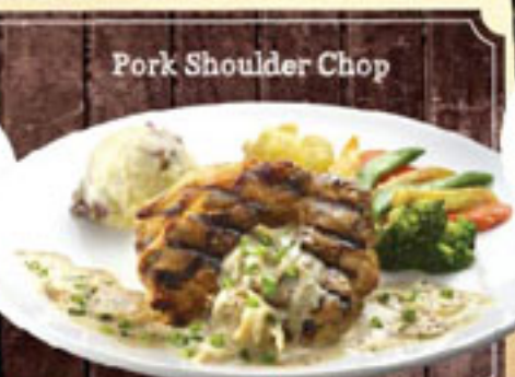
Pork Shoulder Chop